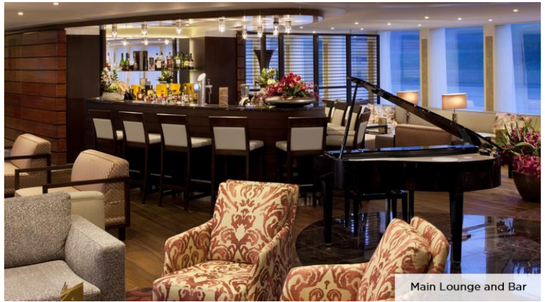
Main Lounge and Bar