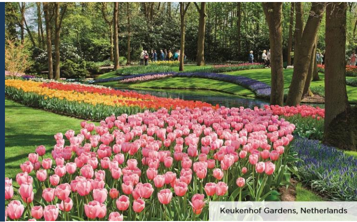
Keukenhof Gardens, Netherlands