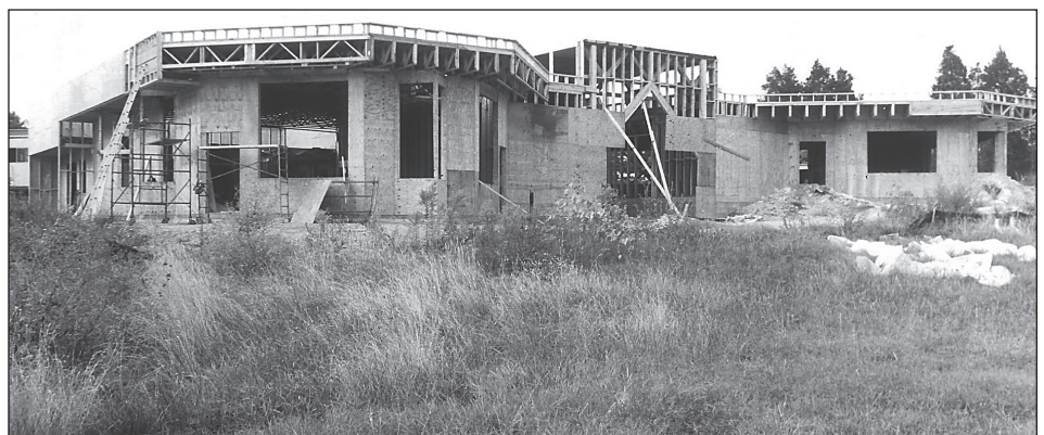
Construction of the new Horticulture Center begins 1994.