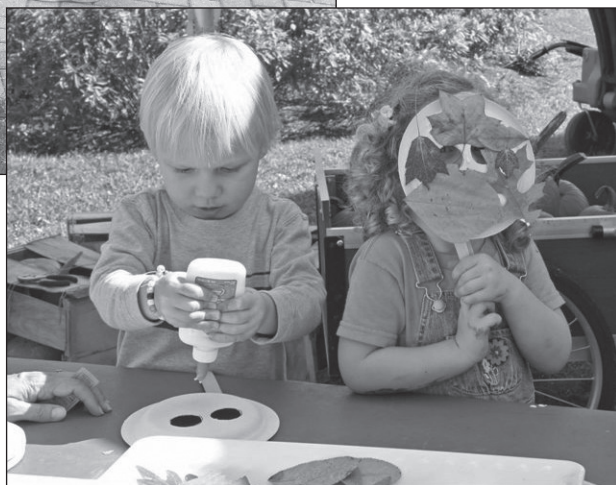
Down Memory Lane Above. Fall Garden Festival, 2011