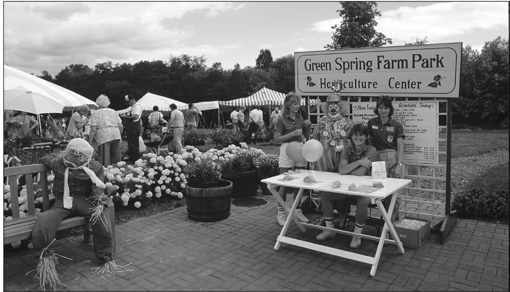
Green Spring staff and FROGS clown helping at an early Fall Garden Day (year unknown).

FROGS monies have also provided crucial physical improvement to the horticultural efforts. Green Spring now has an additional propagation polyhouse and two additional work vehicles. Thanks to your generous response to our Annual Appeals, Green Spring now has a wonderfully renovated gazebo and beautifully renovated glasshouse.