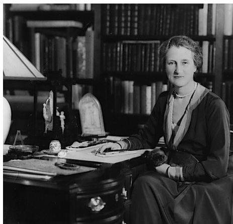
Beatrix Farrand c. 1927

Historic landscapes range from small gardens to national parks, and include farms, quarries, industrial complexes, cemeteries and battlefields. They inform us about significant events, activities and people. They're also vulnerable to harm by forces of nature, development, vandalism and neglect. So it's important to document these special places in order to protect them.