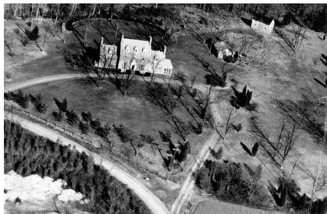
Newly-installed Farrand landscape, 1943.

The recent Garden Club of Virginia restoration of our Farrand crescent garden was guided by the landscape's evolution, which ensured a rehabilitation of her original design that's perfectly attuned to our conditions and purposes today. Now the landscape's inclusion in HALS gives historic preservation practitioners of the future an accurate and enduring resource to guide them towards historical integrity that balances preservation with change.