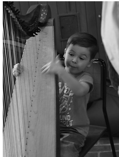
Young harpist at “play”