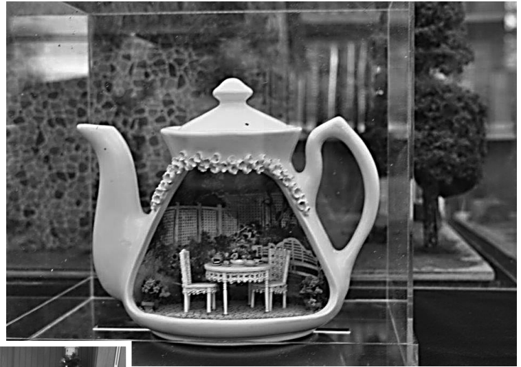
Miniature teapot by Happily Ever After