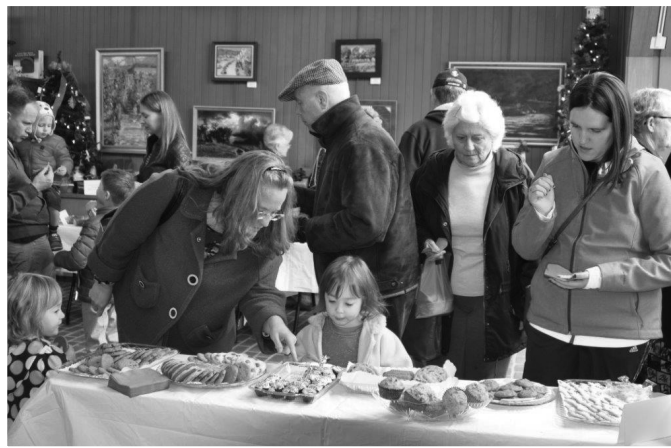
Enjoying the complimentary goodies