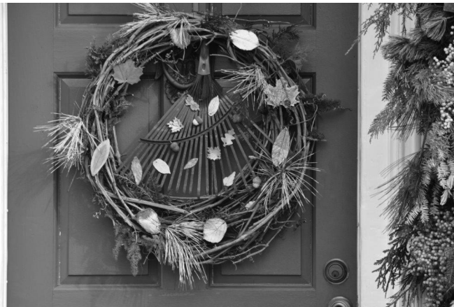
Festive Historic House door