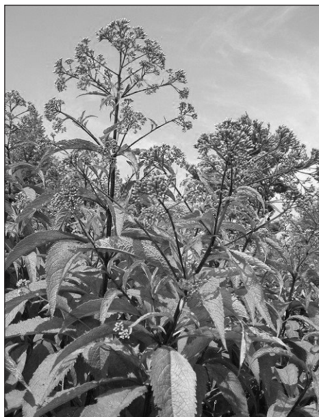
Joe Pye Weed

We are making these gardens more sustainable over time by gradually reducing the number of tender