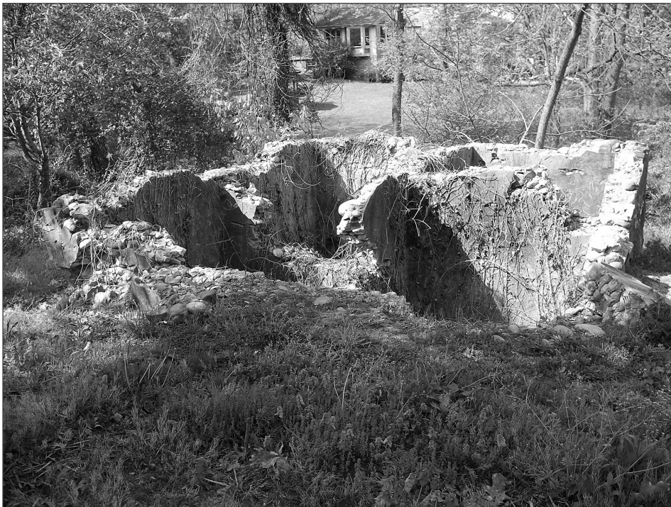
Tank ruin today

Reception for all three artists above is Saturday, July 10, 1:00-3:00 p.m. at the Horticulture Center and the Historic House.