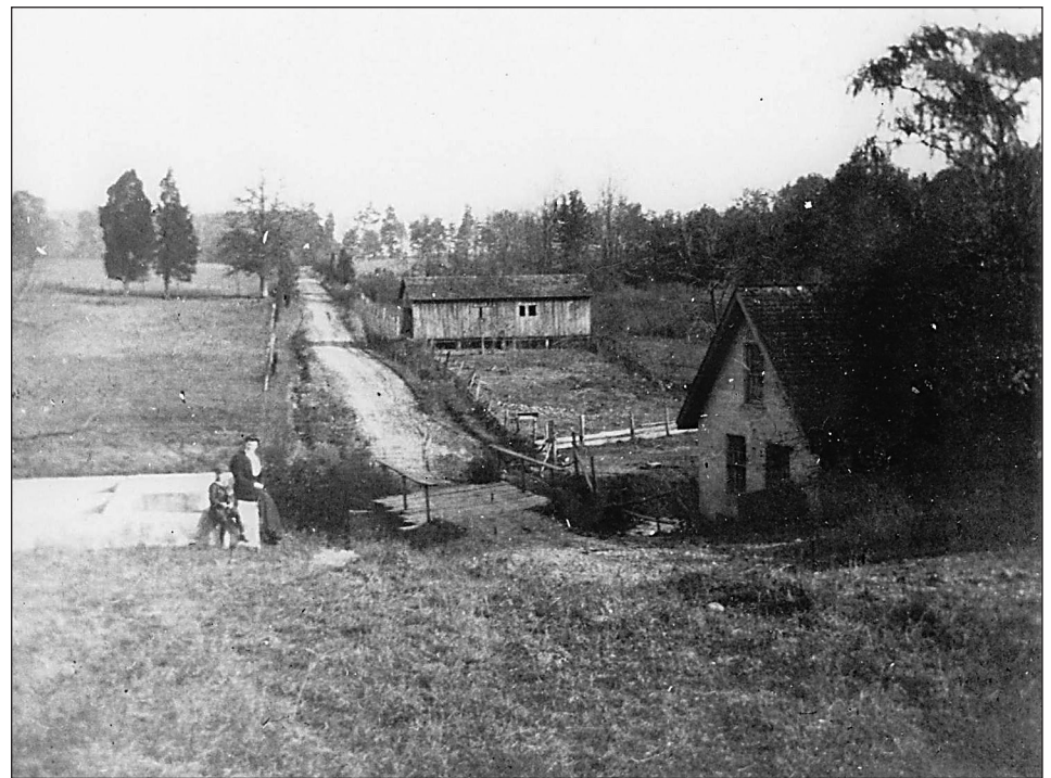
Fermentation Tank circa. 1900