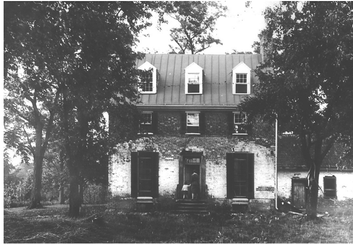
Historic House when purchased by Minnie Whitesell c. 1931 File photo – Historic Green Spring

A log house was purchased and Mr. Pence helped moved the cabin to the property by taking it apart and rebuilding it by placing new mortar between the logs. It was used for storage and later as a guest house.